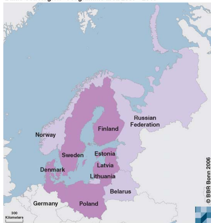
Baltic Sea Region - Programme area 2007 - 2013

The Joint Programming Committee (JPC), representing all eleven partner countries, is the main forum for developing the programme.