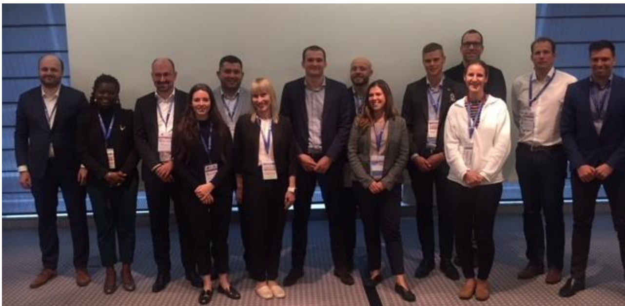
YP Steering Committee - meeting in Berlin

Bulgaria, Czech Republic, Denmark, Estonia, Finland, Germany, Hungary, Italy, Norway, Poland, Romania, Serbia and The Netherlands are represented in the YP Steering Committee.