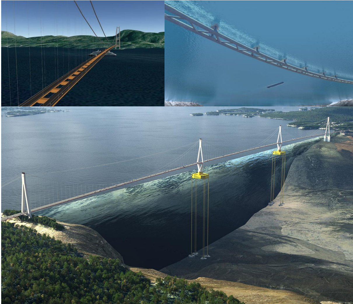
Figure 1: Long-span bridge concepts under consideration in the Fjord crossing project. (Illustration courtesy of 1) Kristian Berntsen/Norwegian Public Roads Administration/Google, 2) and 3) Vianova/Baezeni)

The crossing of the Bjørnafjord is one of the major fjord crossings that has been prioritized in the Fjord-crossing project. This is the widest fjord of all considered bridge crossings along the Coastal Highway Route E39. The fjord is approximately 5 km wide and the fjord depth is approximately 500 m. Concepts such as a submerged floating tunnel, a TLP suspension bridge and floating bridges has been considered as possibilities for the crossing of the Bjørnafjord. After several development phases between 2013 and 2019, the recommended concept is a curved, side anchored, pontoon supported, floating bridge. The construction of the Bjørnafjord crossing is currently planned for the period 2024-2029 pending Government decision.